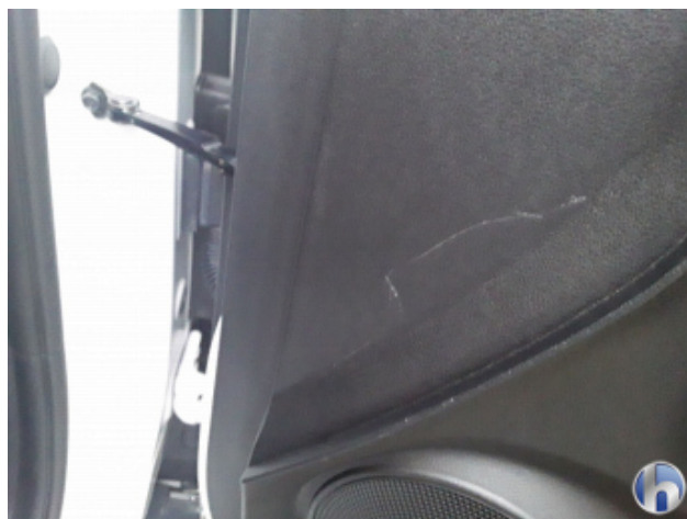
3. Door trim Front - right Wear and tear - Without repair