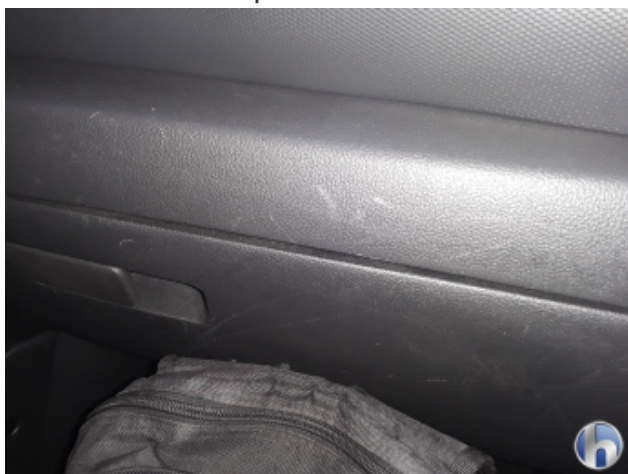
4. dashboard Wear and tear - Without repair