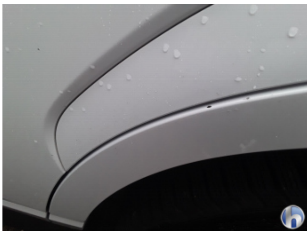
2. Sidewall - Rear - Left Wear and tear - Without repair