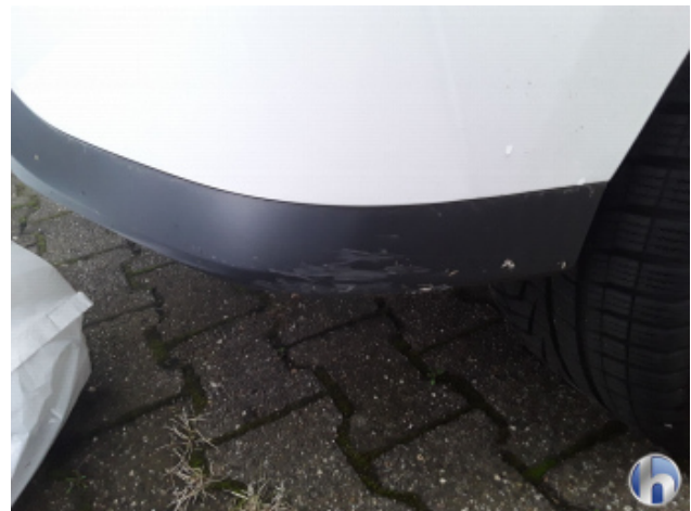
1. Rear Bumper Light scratch - Replace