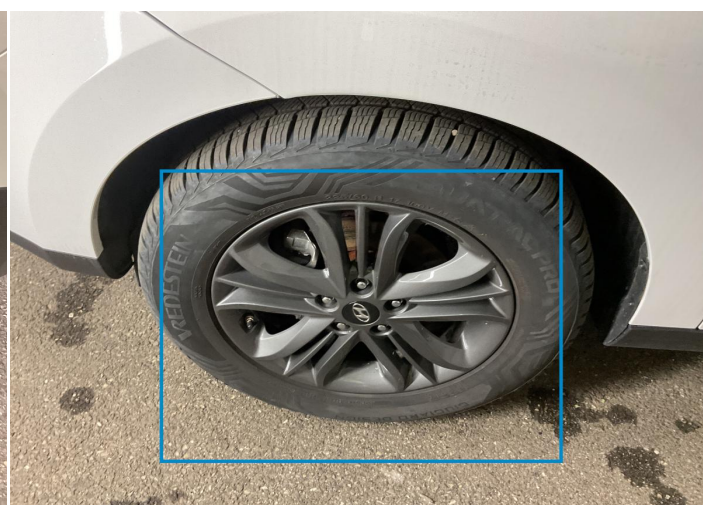
6. Rim / Front Left Out of Bodywork / Scratch -