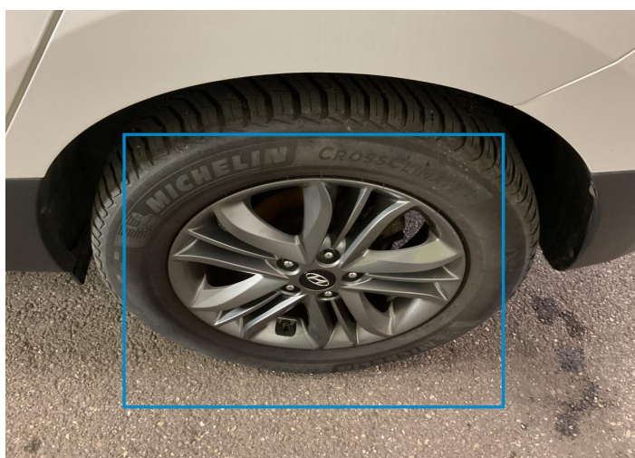
5. Rim / Back Left Out of Bodywork / Scratch -