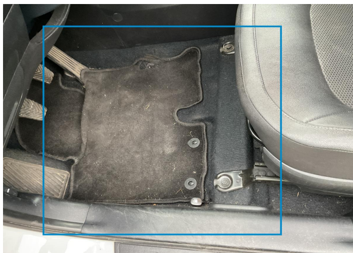
1. Floor Carpet Interior / Dirty -