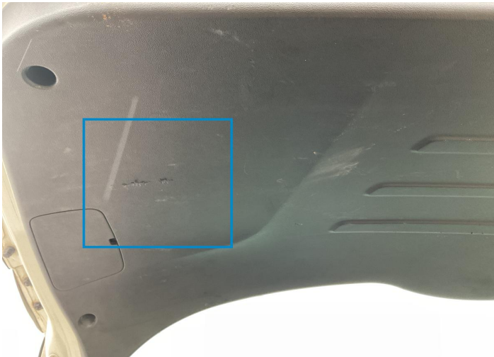
7. Tailgate Upholstery / Back Interior / Scratched -