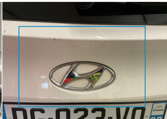
2. Tailgate Paint / Scratch / Line -