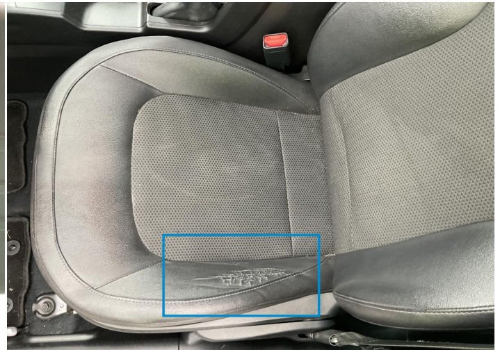
8. Seat Cushion / Front Left Interior / Worn - out -