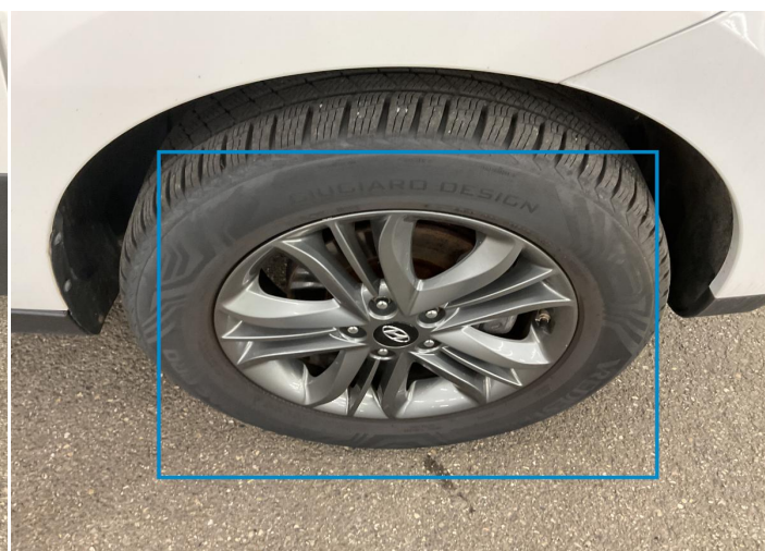
4. Rim / Front Right Out of Bodywork / Scratch -