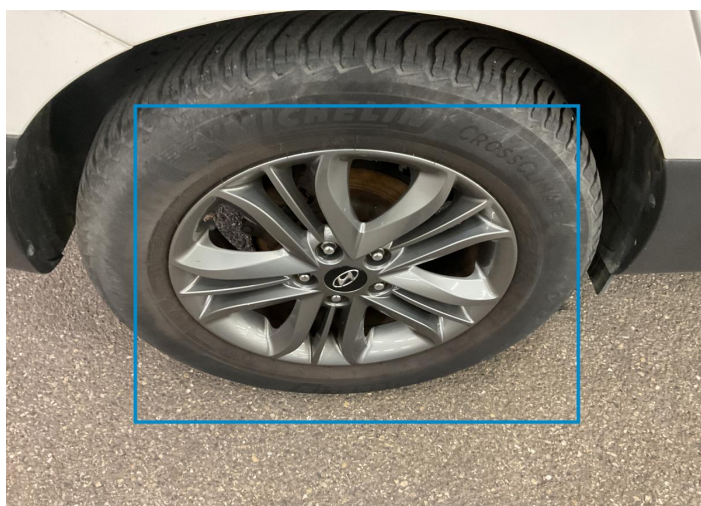
3. Rim / Back Right Out of Bodywork / Scratch -