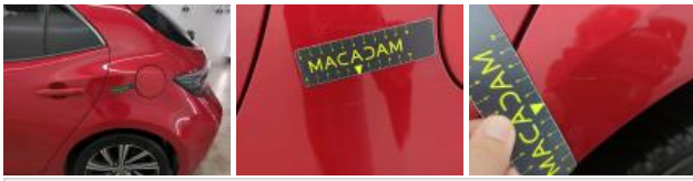
Wing FL, Stone chip(s), Repair and paint (complete)