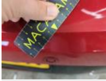
Roof, Hail damage, Paintless dent repair (hail)