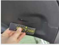
Bumper R, Scratch(es), Repair and paint (partial)