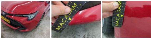
Door RR, Dent(s) and scratch(es), Repair and paint (complete)