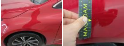
Door FL, Scratch(es), Polish