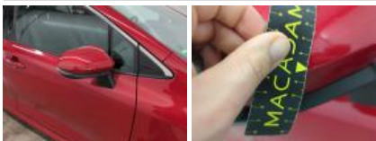
Door FR, Scratch(es), Polish