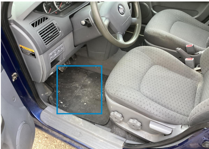
1. Floor Carpet Interior / Dirty -