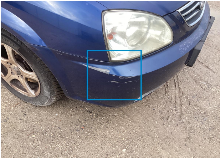
5. Shield / Front Paint / Scratch / Line -