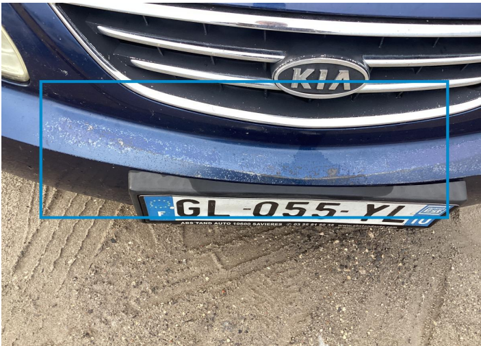
6. Shield / Front Paint / Chemical Damage -