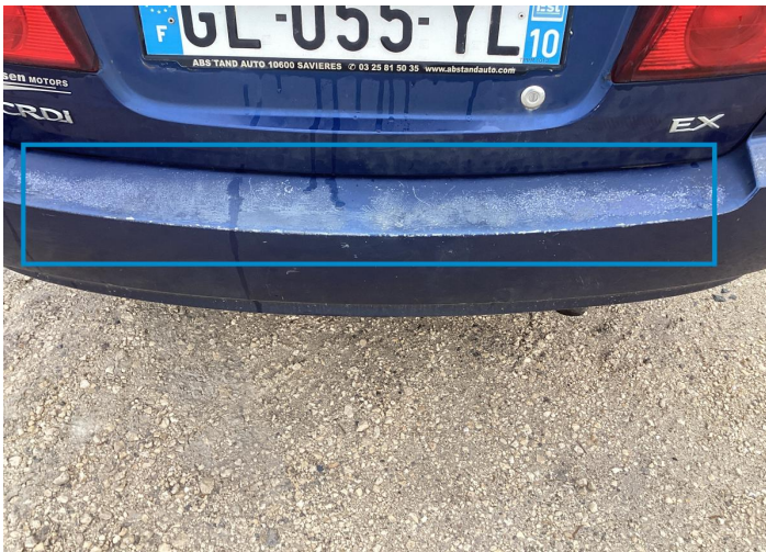
7. Shield / Back Paint / Chemical Damage -