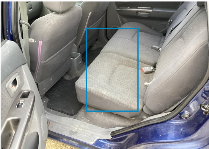
2. Seat / Back Left Interior / Dirty -