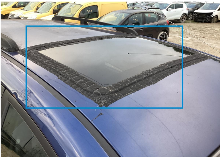
4. Sunroof Paint / Corrosion -