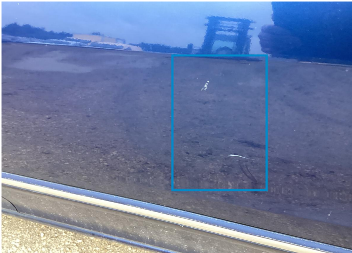
9. Door / Back Left Paint / Scratch / Line -