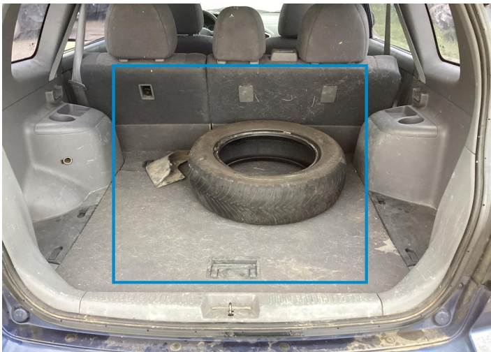
3. Trunk Carpet Interior / Dirty -