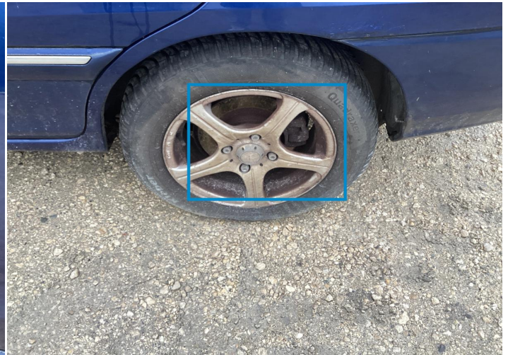
10. Rim / Back Left Paint / Chemical Damage -