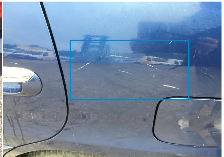
8. Fender / Back Left Paint / Scratch / Line -