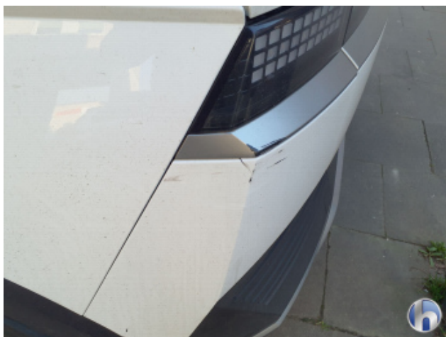
1. Rear Bumper Damaged - Replace