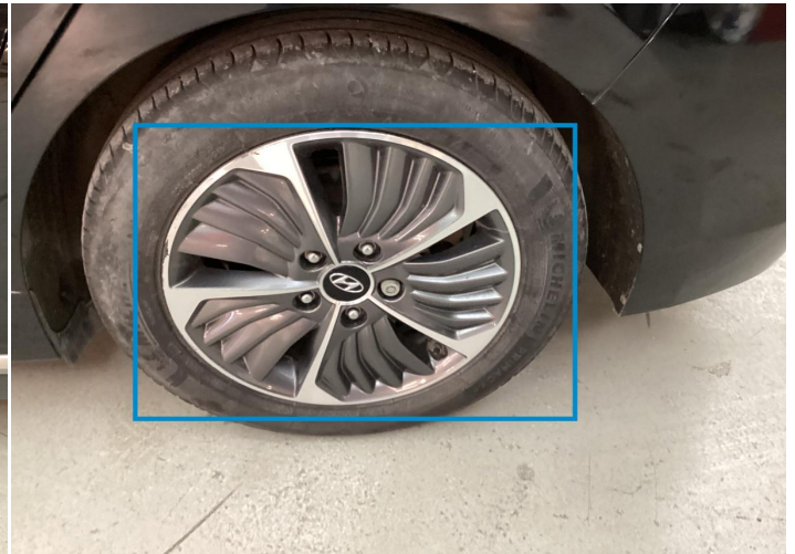
2. Rim / Back Left Out of Bodywork / Scratch -