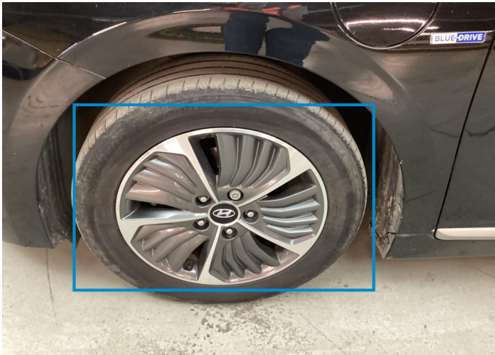
1. Rim / Front Left Out of Bodywork / Scratch -