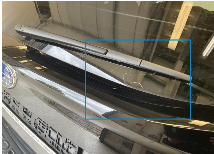
1. Tailgate Paint / Scratch / Scuff -