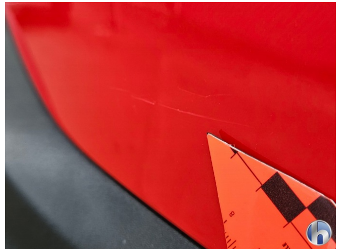
5. Rear bumper