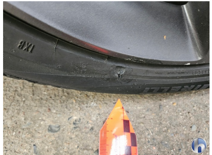
7. tire front - right